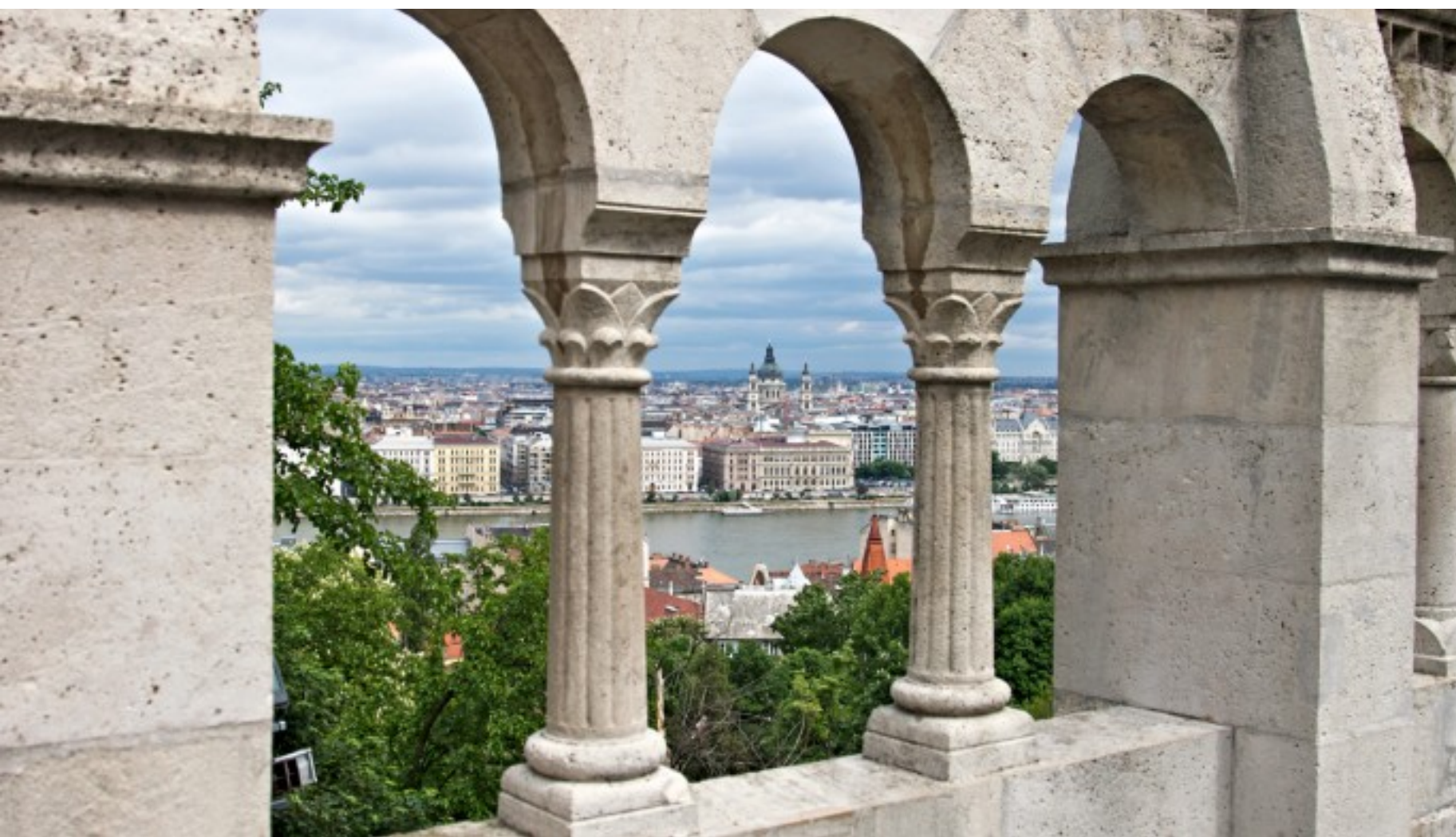
Enjoy panoramic vistas of the Danube from Fisherman's Bastion, located on Castle Hill.